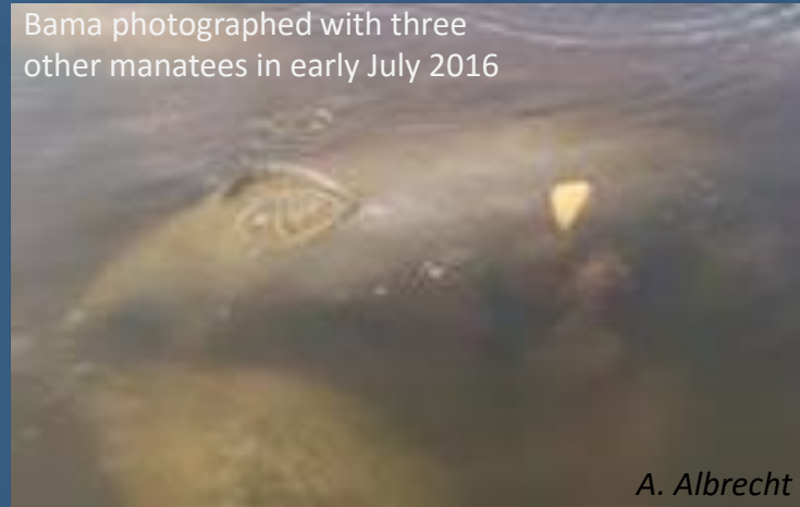
Bama photographed with three other manatees in early July 2016

In 2009, Bama was captured and tagged by the MSN team in the Mobile-Tensaw Delta, becoming the first manatee tagged in Alabama waters. Prior to her sighting this summer, Bama was undocumented for three years, last seen in Florida in 2013. In a photo (below) shared by a local resident, the MSN team identified Bama by the distinct triangular propeller scar on her back. Reports suggest she may be the focal female of a mating herd in the Dog River area.