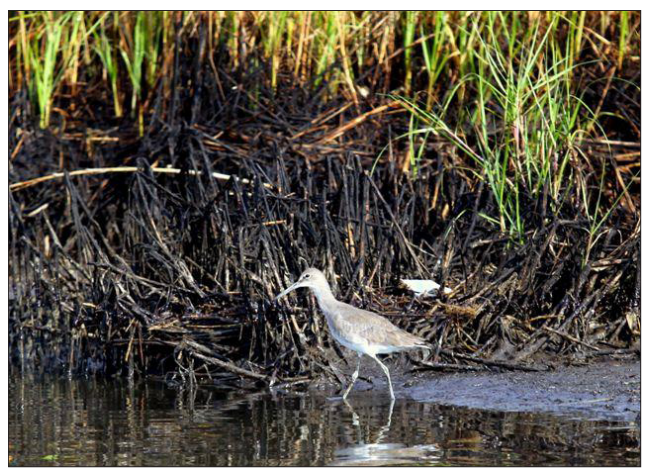
Samples were collected along the Gulf Coast, from oiled marshes in Barataria Bay (pictured above) to pristine Apalachicola Bay.