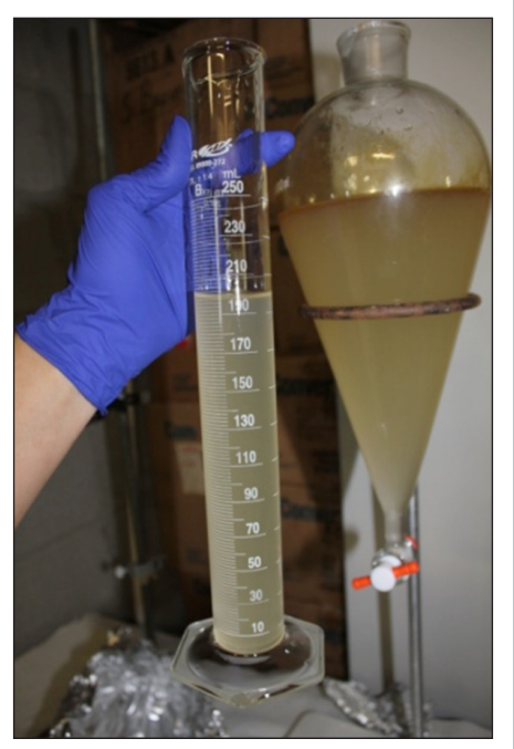
Oil and water mixture used in exposure experiment on larval and juvenile spotted seatrout.

They used a laboratory technique known as qPCR to look for a gene that is expressed by the liver and a known biologic indicator of contaminants. High levels of this gene are an indication that the body is in the process of breaking down toxins. All of the fish that were exposed to oil and dispersant in this study showed signs of this process occurring. The endocrine system which regulates growth, reproduction and development was also evaluated by qPCR. Griffitt looked for changes in proteins expressed by the liver that are associated with the hormone estrogen and egg production. Although it is known that hydrocarbons can disrupt the endocrine system, no disruption was observed in this brief exposure experiment. Griffitt also found that growth was affected in both the larval and juvenile fish by exposure to oil and dispersant. A reduction in growth rate was observed in the oil and dispersant mix treatment and the dispersant alone treatments for the larval fish. While Griffitt's research is limited to a single species of fish, his experiments provide one small window into the potential effects of the oil spill.