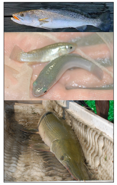
Scientists are examining sea trout, gulf killifish and alligator gar to monitor effects of the oil spill.

In the past, oil exposure has been associated with devastating infectious disease outbreaks in wild populations of fish. The links between these outbreaks and the oil exposure are circumstantial but they suggest an associated disruption of the immune system. Scientists at Mississippi State University hope to use state-of-the art laboratory techniques to determine if the Deepwater Horizon oil spill is affecting the health of fish populations in the Gulf of Mexico.