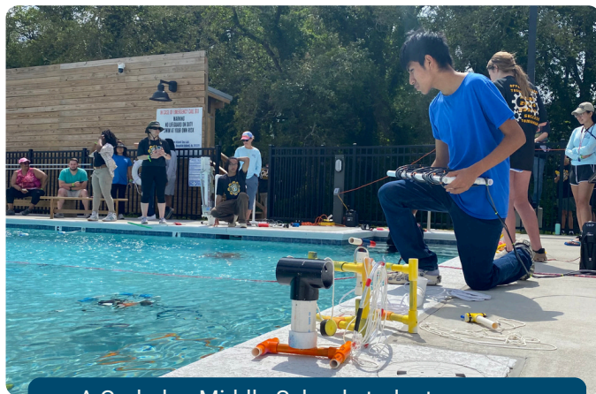
A Gadsden Middle School student manages the team's ROV during the pool mission.